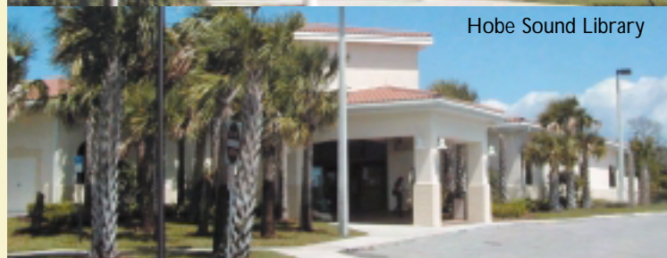
Hobe Sound Library