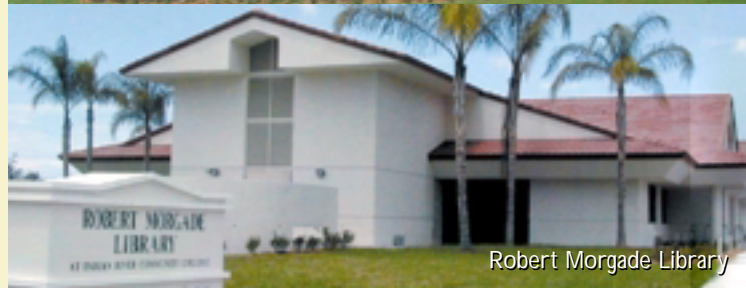
Robert Morgade Library