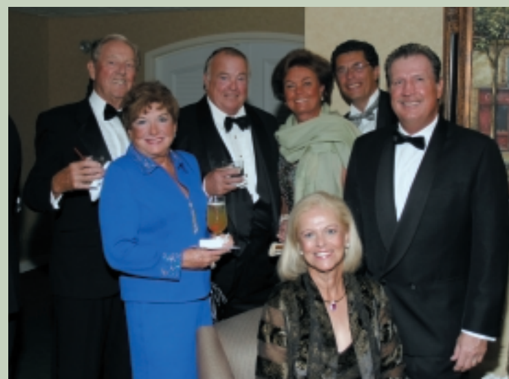
Walgreen friends – caption to come