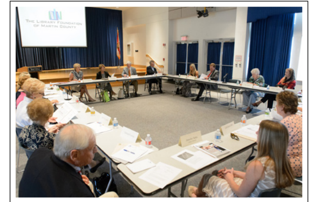
A meeting of the Library Foundation Board of Directors in the John F. (Jack) and Rita M. Armstrong Wing at the Blake Library.