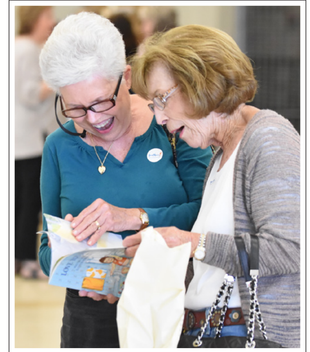
While at BookMania! , attendees purchased children's books for the Martin County School System.