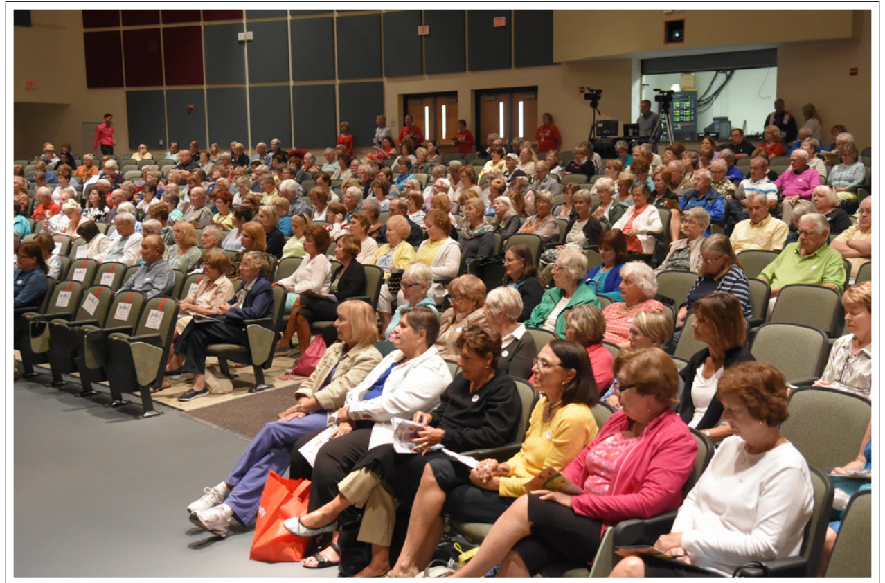
■ The annual BookMania! program brings together a diverse selection of authors and hundreds of book fans.

The one-day free event with presentations by individual authors, category panels with moderators and an active Q & A is an evolving format that underscores the successful collaboration of the Library System and the Foundation.